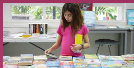
ES + MS Book Fair