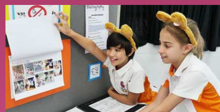
Elementary PYP Exhibition