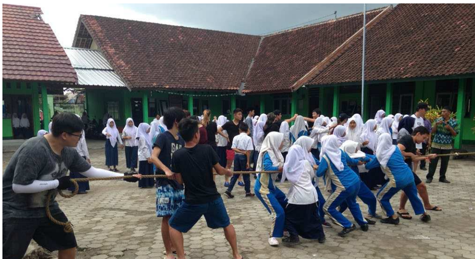
Lombok - Playing games with students of a local school

The High School Week Without Walls is an action packed week for our staff and students. We ran four very different programmes, but all aimed to provide rich experiences for our students that will last a lifetime.