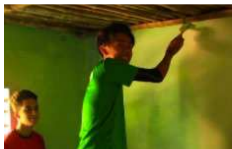
Hoi An - Painting the home of a needy family