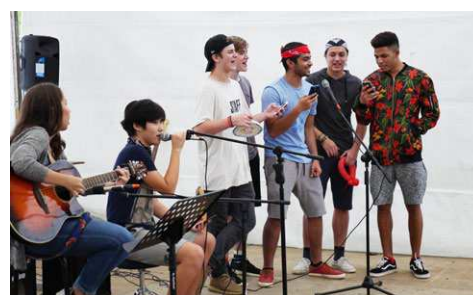
Our high school students performing "Lucky" by Britney Spears

Every January, the PTA committee will hit the ground running. Why? The annual ISS PTA Fun Fair and its related whirlwind of preparatory activities that take place in order to organise an event of this scale! This year was no different.