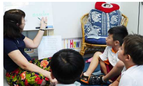
Practising saying new words together

F: As it's true that all children are different, a bespoke approach to teaching is important. What's unique at ISS International School is that class sizes are small. In effect, teachers know their students very well and can cater their lessons to students' needs more effectively. The ESL department is always discussing student achievement and reviewing every student's language learning journey to better support him or her at every stage.