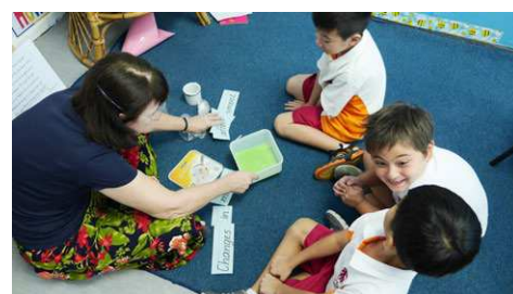
Learning science-related words using a fun jelly-making activity