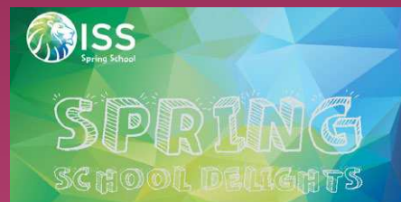
ISS Spring School