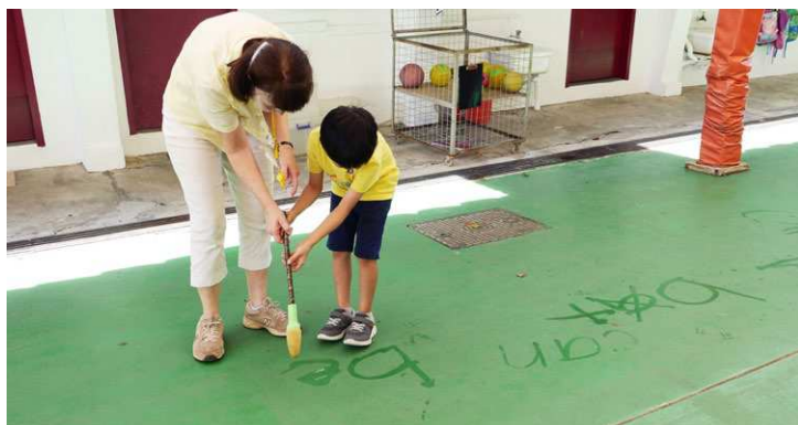
Having fun practising our spelling by writing on the ground with water!

Article: “Can My Child Join An English-Language School?” continues.