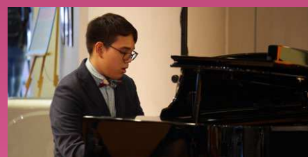
High School Diploma Concert