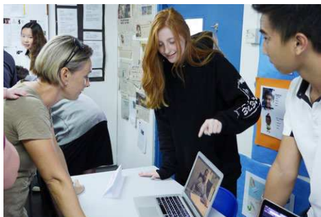
Parents are invited to come and see the projects, too