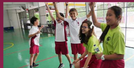
MS Spirit Week