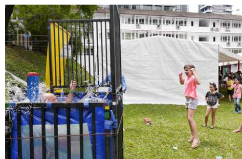
The dunk tank is a highlight every year!

As always the PTA is humbled by the overwhelming support shown by our community – whether in donations, volunteering time or supporting your children, all of which is hugely appreciated by us.