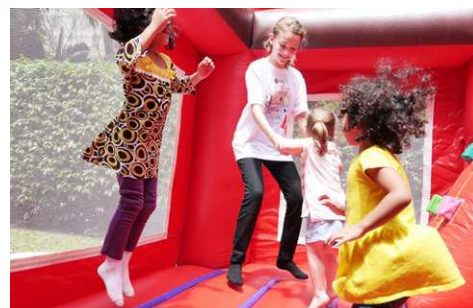
We love the bouncy castle!