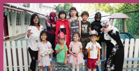
ES Book Character Parade