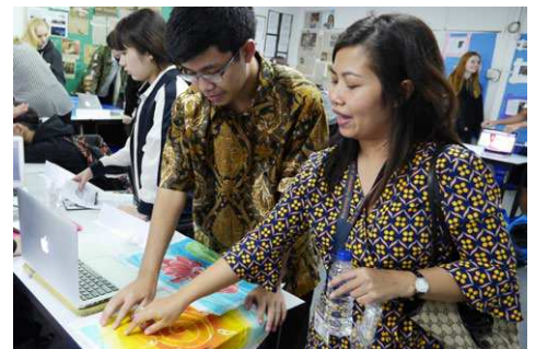
Sharing his tutorial on 'How to do batik'

The personal projects will be graded internally by our teachers before they are sent to the IB for moderation. The final results will be sent to ISS in early August 2017.