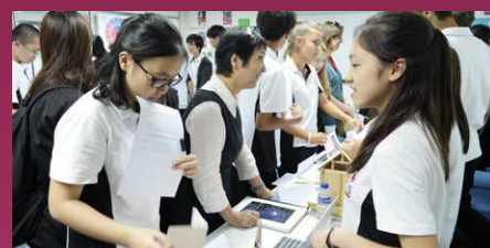
HS MYP Personal Project Exhibition