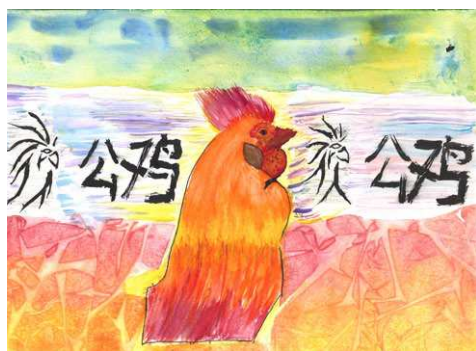
Dorrie's drawing of a rooster