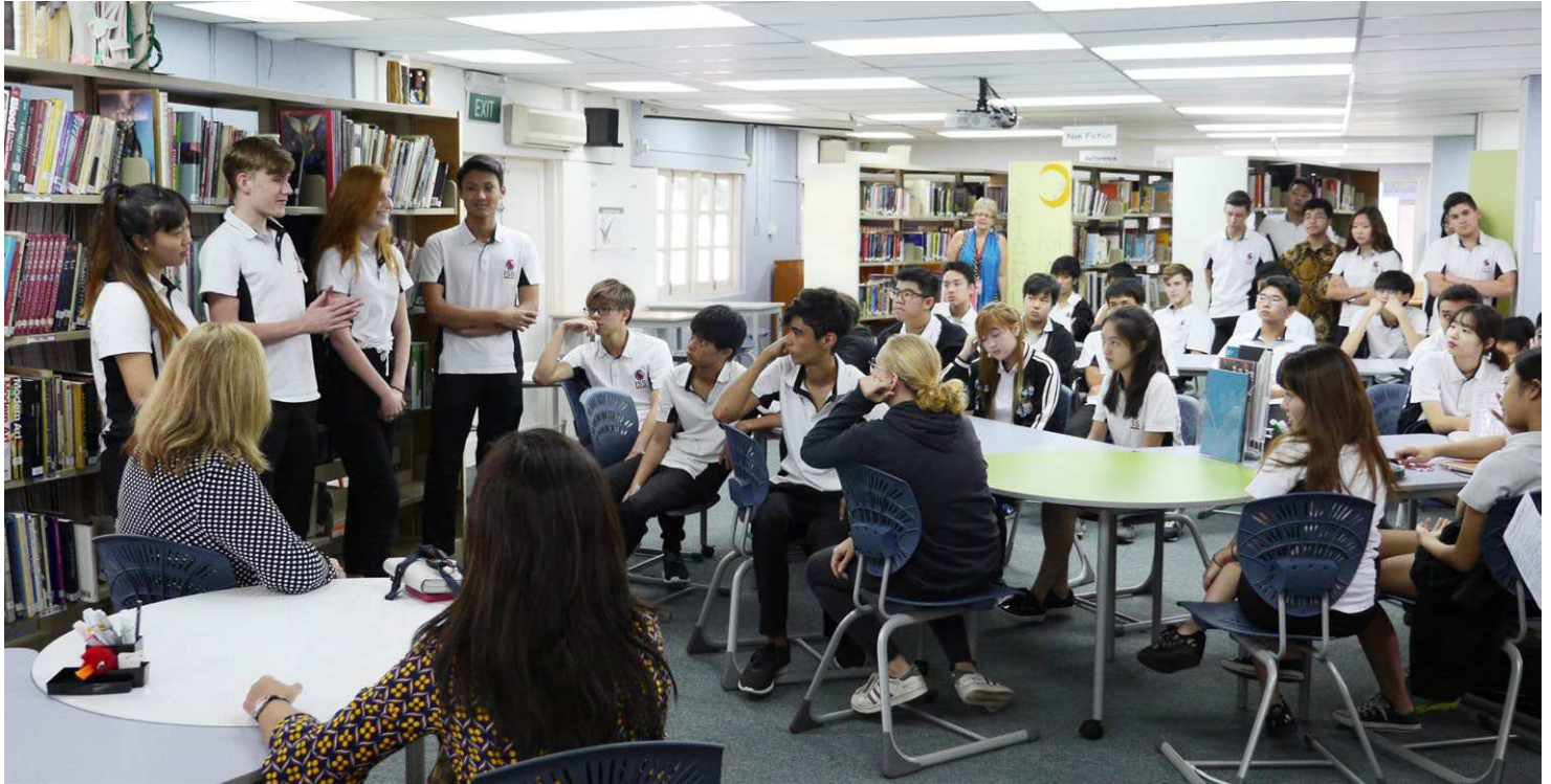
Sharing their experiences and what they have learnt

This year's Personal Project Exhibition, held on Thursday 8th February, showcased a wide range of projects that our Grade 10 students completed this year. The personal project is a requirement in the final year of the MYP. It encourages students to practise and strengthen their Approaches To Learning (ATL) skills, to consolidate their subject-specific learning, and to develop an area of personal interest. The project provides an excellent opportunity for students to produce a truly personal and creative product.