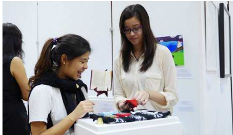
Asking questions and learning more about the concept behind the art