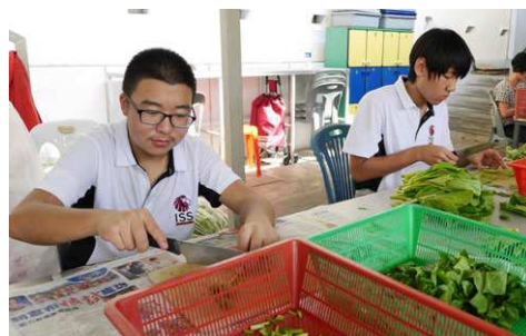
Discover Singapore - Willing Hearts Soup Kitchen