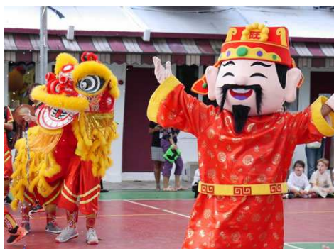
Happy Chinese New Year!

Our international community; teachers and students alike, ushered in the year of the rooster with a variety of boisterous and fun activities across all grades.