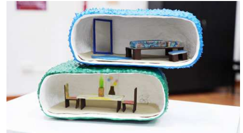
Basic by L. B.