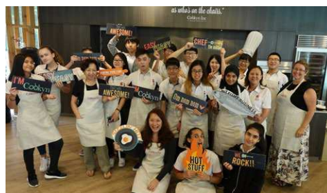
Discover Singapore - Cookyn Challenge