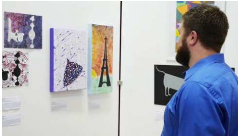
The art was very impressive!