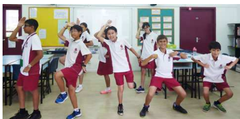
Grade 6 'Happy Roosters'