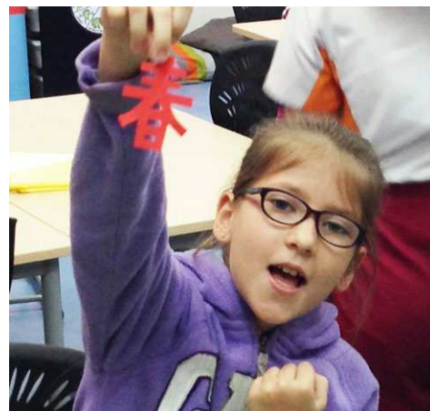
Paper cutting of the word 'Spring'!