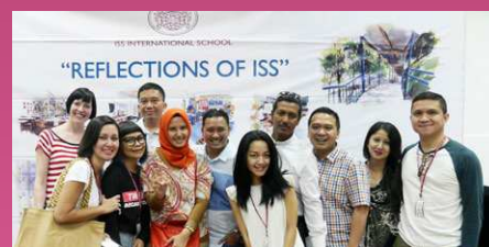
Alumni Reunion Gathering