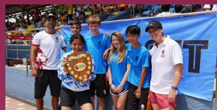
MS + HS Track & Field Day