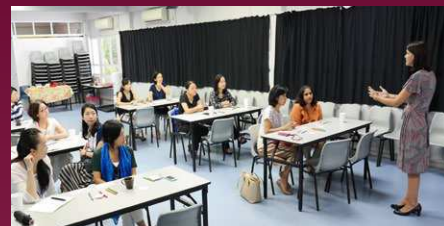
ES Math Coffee Morning

Some of our alumni from the 1980s will be returning to ISS for a reunion gathering. We look forward to having them here, and hearing their stories and memories of ISS!