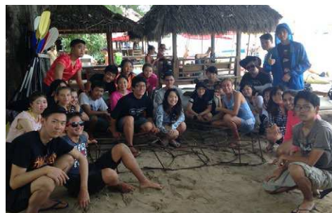
Lombok - We created a bio-rock for ISS, and perhaps future students may be able to snorkel above the ISS bio-rock on Gili T, and record the amount of coral growth present

A very big thank you to the staff who made these trips happen. We all believe that these experiences outside of the classroom enrich the learning that occurs in our classrooms. These unique experiences provide an opportunity for every student to reach their full potential and truly 'Make a Difference'.