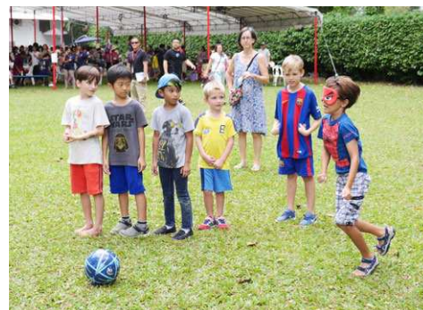
Score a goal blindfolded and win a prize!