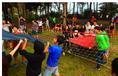
Hoi An - Playing games with kids from the local primary school