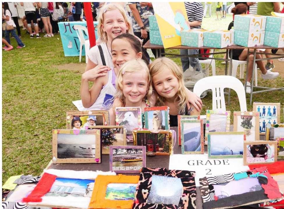
Our elementary students selling the beautiful photographs they took of Singapore