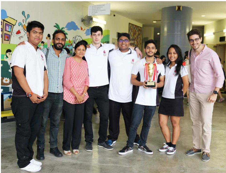
Mindful Mugs Win

You can watch their video which won 1st prize here!