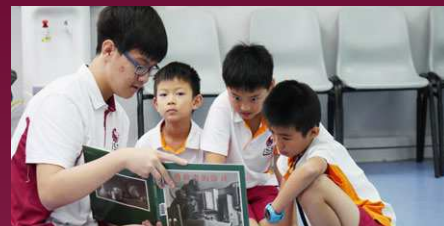
ES+MS Literacy Week - Mother Tongue Reading Sessions

We enjoyed wonderful performances by our Diploma Programme (DP) Music students at the Esplanade Library. They did an amazing job! It was a very lovely evening. Thank you to all who came to support our DP students.