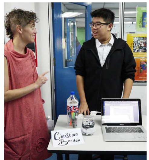
Teachers ask Grade 10 students about their projects