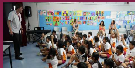
ES+MS Literacy Week - Author Visit