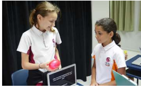
"How does static electricity work?"