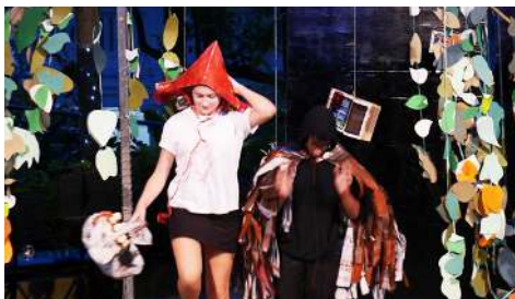
Little Red Riding Hood going to Granny's