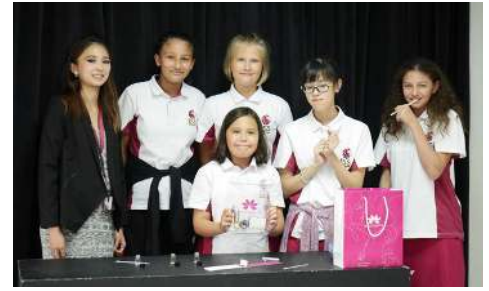
Asking some questions after the talk!

Science Week was amazing! Students (and staff!) had a diverse range of opportunities to learn something new. There were films highlighting why we must look after our planet; the ever popular Science Exhibition; and the challenge of the Science Quiz.