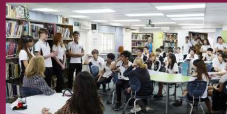
G10 Personal Project Day