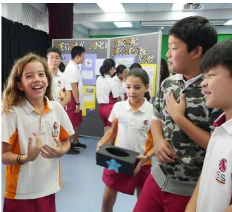
Sharing their research on products that don't test on animals

The Primary Years Programme (PYP) Exhibition displayed amazing learning. All of our students worked hard with great commitment to working collaboratively while conducting an in-depth inquiry into a real life issue or problem and engaging in deep and meaningful action. Some students researched animal cruelty and highlighted brands that do not test their products on animals. Another group made their own maglev train using magnets and plastic 'train tracks'.