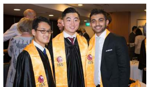
Celebrating their high school journey