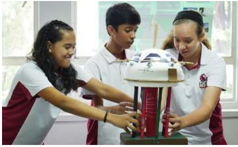
One of the sustainable homes