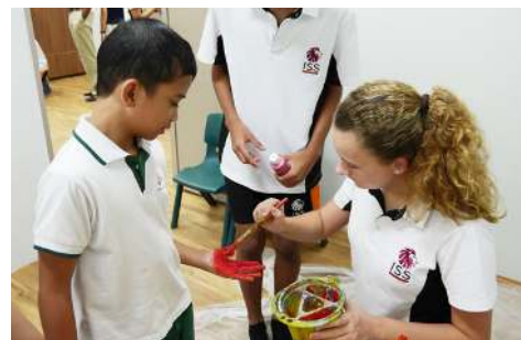
Getting our hands painted for the chair!

ISS International School students collaborated with the Rainbow Centre on their 'Rainbow Chair-ity' project, to design chairs that expressed abstract ideas of awareness, inclusion and empowerment for children with disabilities. This is just one example of the many 'Creativity, Activity, Service' projects that students can select and engage in, to help identify their core strengths, while supporting community causes.