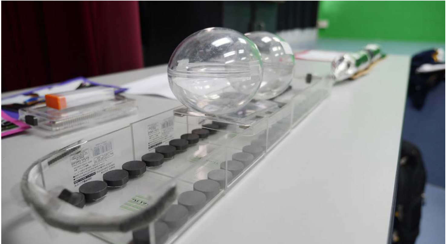
One student's DIY maglev train!