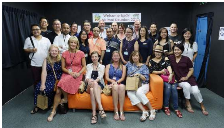
Reunited... and it feels so good!

“The canteen used to be here. There were tables, and we’d have lunch all together here. Now it’s the hall!”