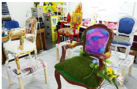
The four beautiful chairs our students created