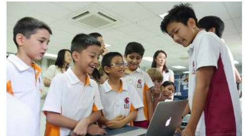
Grade 8 sharing with students from younger grades

One of the highlights was the visiting scientist from Eurofragrance. A chemist by trade, she enlightened and inspired our students with tales and descriptions of working for a major perfume company. All present had a new found respect for how and why we create perfumes, soaps and shampoos, and some of us were inspired to consider a career in chemistry!