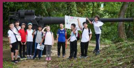
Grade 5 Camp