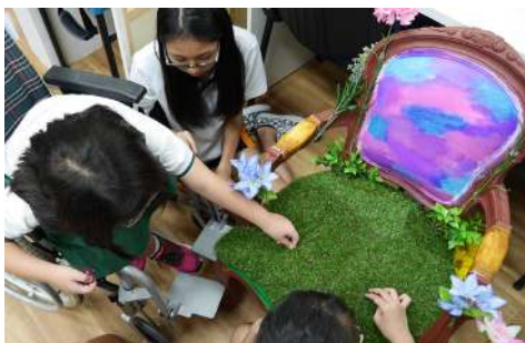
Working together with students from the Rainbow Centre on this beautiful chair