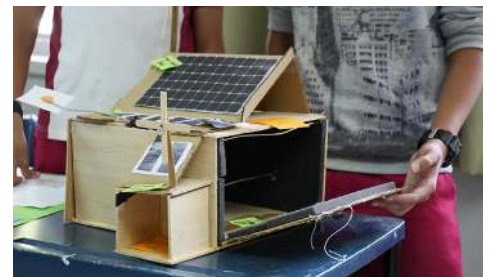
This home will be in Switzerland, and can withstand avalanches