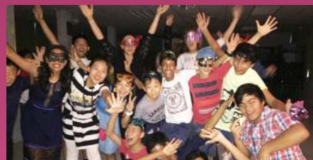
MS Masquerade Disco