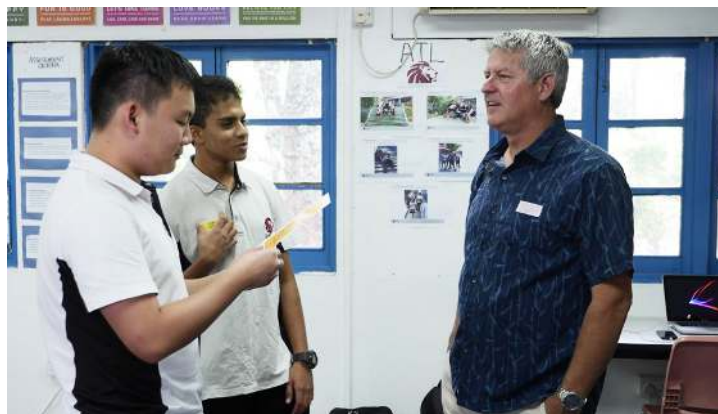
Our student ambassadors chatting with their school seniors