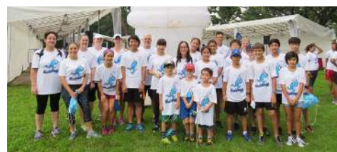
Students across all schools (elementary, middle and high) participated in the Urgent Run