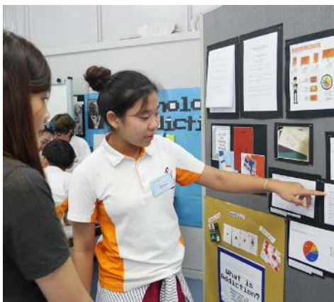
Talking about "Screen-Off Wednesdays", one of this group's initiatives

Students collectively synthesised all of the essential elements of the PYP and shared their learning journey with students, parents, teachers and members of the ISS community.