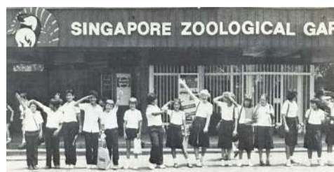
Visiting the zoo!