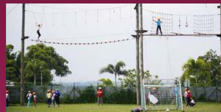
Grade 4 Camp