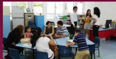
School Orientation for New Students

We organise talks for our parents to learn more about the IB curriculum and the different subjects we teach at ISS. Join us for our coffee mornings, to learn more about what your child is learning in school.