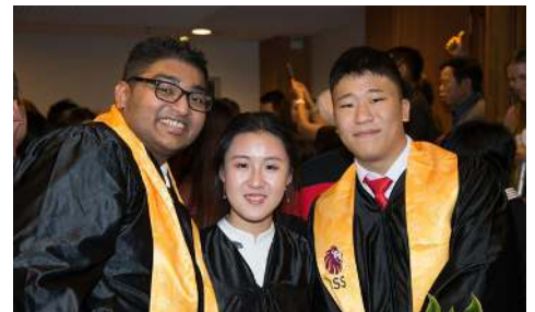
Alumni of ISS