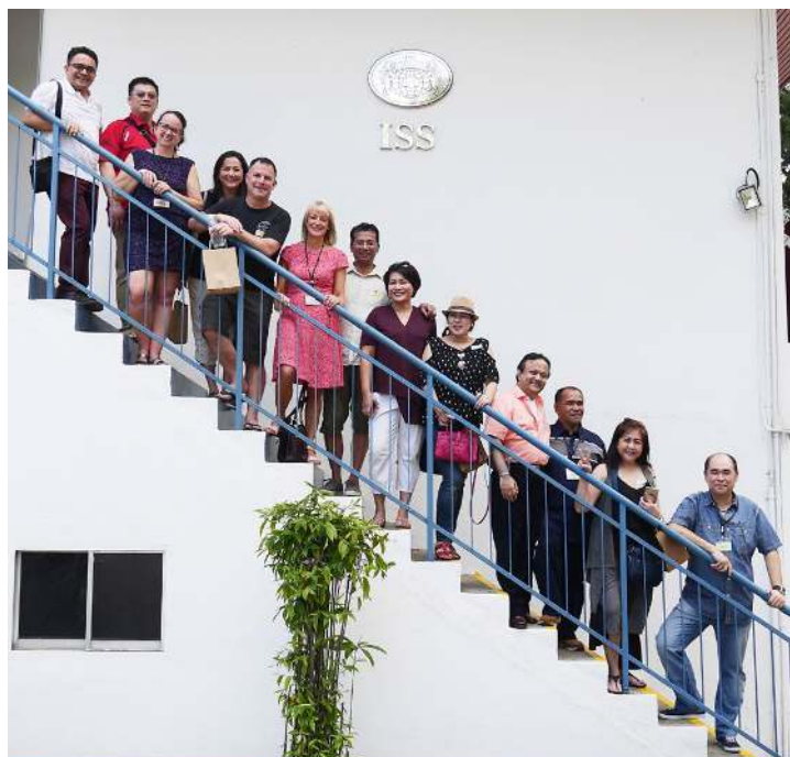
Going on a tour of the school!