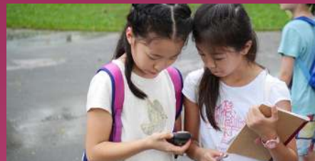
Grade 3 Camp