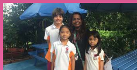
Teacher Visit from Pakistan