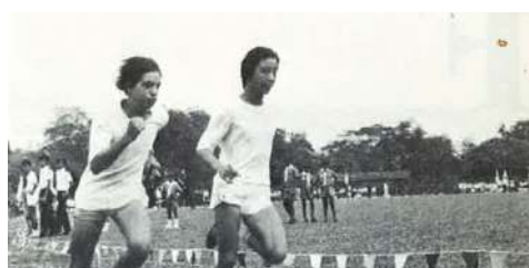
Running a race