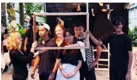
Hansel & Gretel with their parents

"The dreamer awakes, the shadow goes by, the tale I have told you, that tale is a lie, but listen to me, for the tale is a lie but what it tells is the truth. T'was an eve of such melody, such laughter and such twist that the grimm was woke till dark upon Preston."