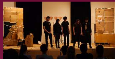
G11 Play in a Box

Service as Action is a big part of our curriculum, and at the middle school, we like to finish off our school year serving the community in Singapore.