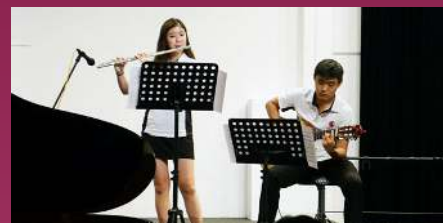
G12 Lunchtime Music Recital