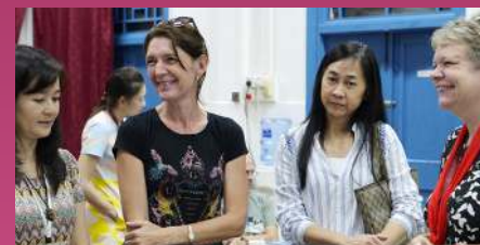
MS & HS MYP Mother Tongue Information Evening