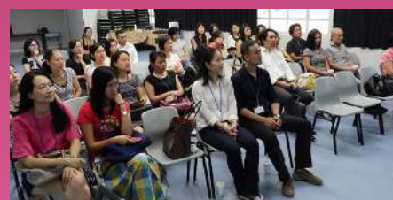
Teaching and Learning in the PYP & MYP