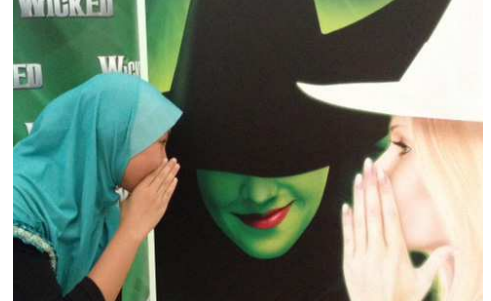
We went to see the musical, Wicked

At the end of the semester, students shared their reflections of what they had learnt in written journals. Some students observed in their journals that there was a need, as an actor, to be dynamic and adjust oneself to be in harmony with