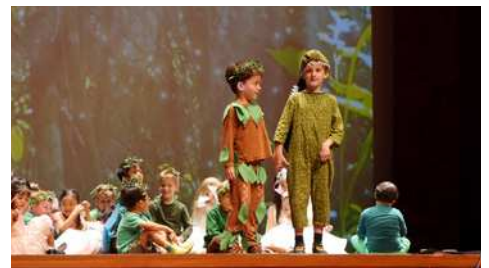
Showing inclusiveness with a skit