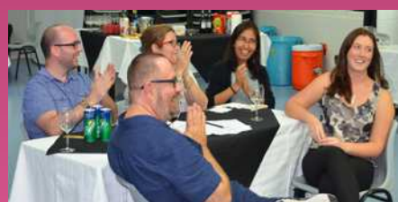
PTA Quiz Night