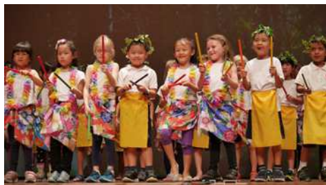
Creating music with sticks