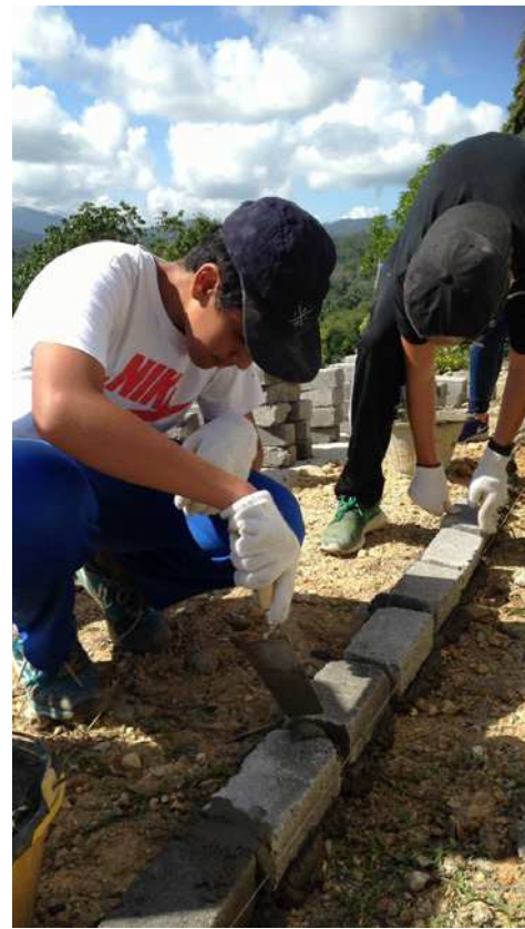
Borneo - Building flower box walls

Week Without Walls (WWW) takes learning beyond the classroom. Every trip expands each student's personal development, furthers their role as active global citizens and brings authenticity into their curriculum. These journeys create learning experiences that encourage each student to realise their potential. WWW is one of the building blocks that assist in creating success in a child's academic life and beyond. It continues to offer the opportunity to develop an individual's physical, social and emotional wellbeing, a healthy and positive disposition, connectedness with others, and self-awareness. Every WWW trip provides the opportunity to learn, contribute to our local and regional communities, and dare we say, for a little adventure!