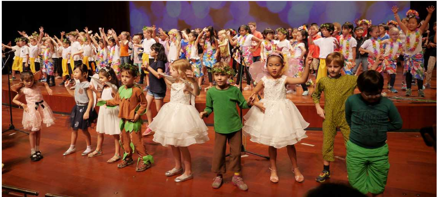
What a wonderful performance!

ISS Elementary School Performing Arts did something very special this year for their annual concert. Using the PYP Attitudes as their framework, students wrote their own play, including one original song. A small group of students from the Grade 4 and 5 "Scriptwriting and Stage Production" ECA did the bulk of the writing, but students across the entire school had a hand in creating costume and set ideas, choreographing dances, creating drama pieces and working out instrumentation. This was a student-driven, inquiry based play with ties to some Units of Inquiry as well. And perhaps the best part of all is how much fun the students had preparing for this show! We were amazed and inspired by their enthusiasm, skill and talent. This proved to be a show like no other!