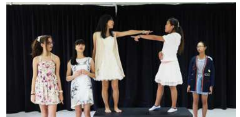
A very passionate rendition of “What is this feeling?” from Wicked, the musical.