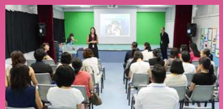
ES Learning Languages Coffee Morning