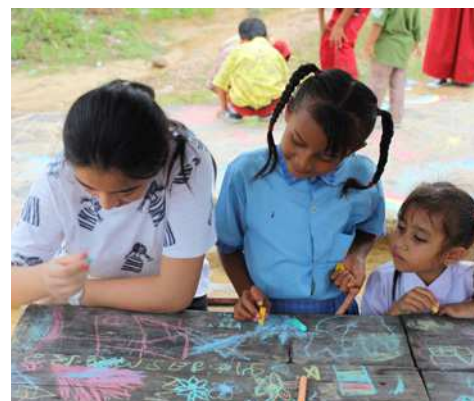
Telunas - drawing and colouring with the kids