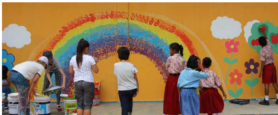
Telunas - Painting a beautiful wall