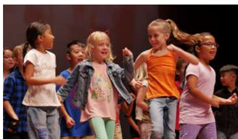
Such joy and passion!