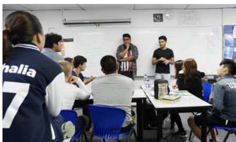
Sharing ideas and building our brand