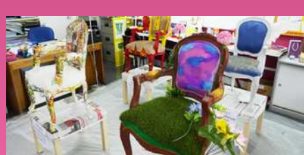
Rainbow Chairity @ ION