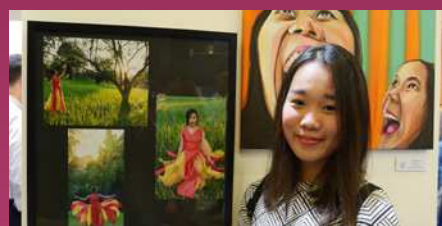
IN Art Exhibition