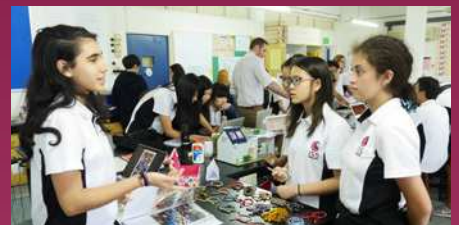
HS MYP Personal Project Exhibition