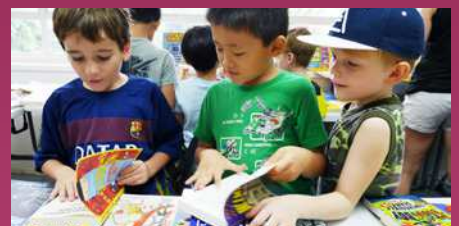
ES + MS Book Fair