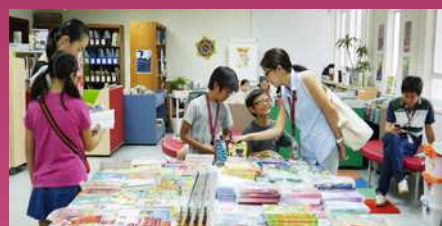
ES Book Fair