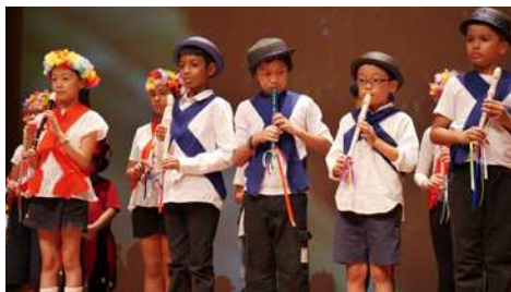
Wowing the audience with our recorder skills