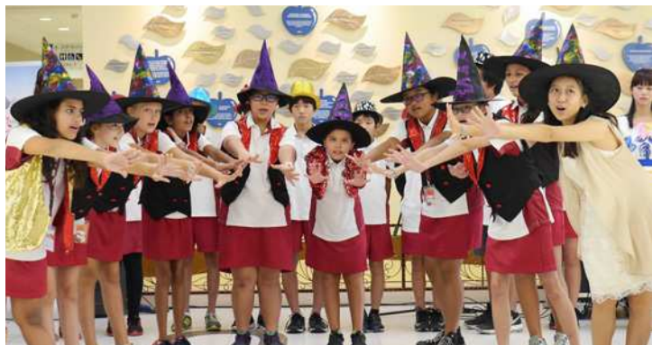
Performing at the MusicFest@SGH in October 2016!

Article: “Wicked Way to Learn” continues.