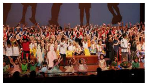
The Grand Finale!