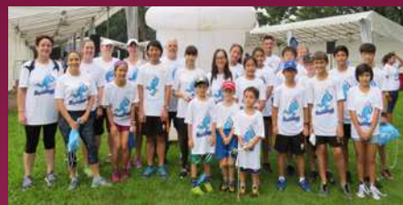
MS Urgent Run