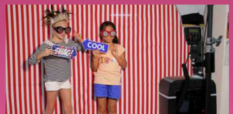
PTA Fun Fair