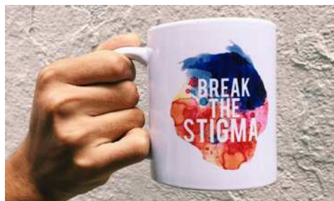
Our 'Break the Stigma' mindful mug

For more information on the company and the team members, please visit their website: mindfulmugs.co.vu!