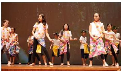
A Hawaiian dance