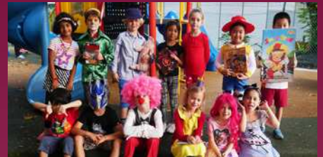
ES + MS Literacy Week