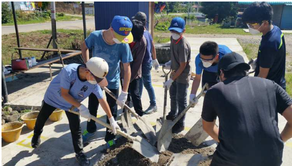
Borneo - Mixing cement for the bus shelter

Week Without Walls (WWW) takes learning beyond the classroom. Every trip expands each student's personal development, furthers their role as active global citizens and brings authenticity into their curriculum. These journeys create learning experiences that encourage each student to realise their potential. WWW is one of the building blocks that assist in creating success in a child's academic life and beyond. It continues to offer the opportunity to develop an individual's physical, social and emotional wellbeing, a healthy and positive disposition, connectedness with others, and self-awareness. Every WWW trip provides the opportunity to learn, contribute to our local and regional communities, and dare we say, for a little adventure!