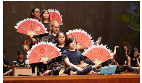
A beautiful fan dance