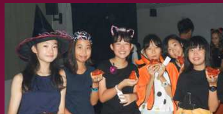
MS Halloween Disco

Our students performed at the Eurasian Association Christmas Lunch every year, and we really enjoy bringing joy and cheer to our audience there!