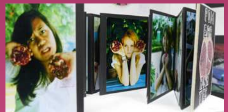
HS G12 Art Exhibition